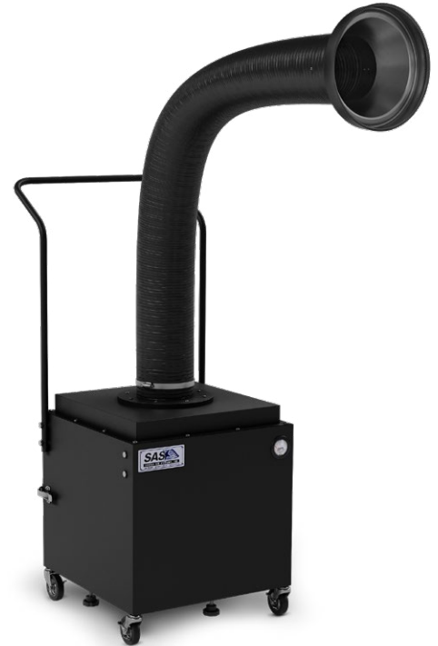
Model 450 Portable Floor Sentry

Two smaller models [SS-300-PFS & SS-400-PFS] and a larger model [SS-500-WFE-MP1] are also available.