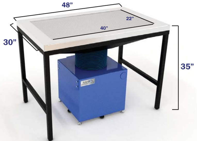
Dimensions are Approximate