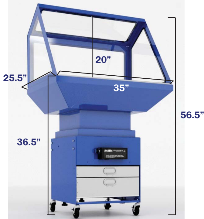
Dimensions are Approximate