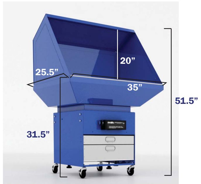
Dimensions are Approximate