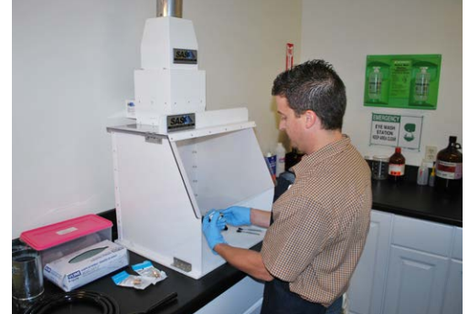
SS-200-MSP Shown Above