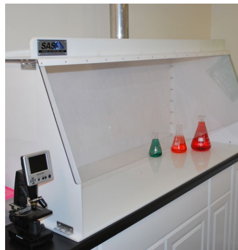
Ducted Fume Hoods provide fume extraction for various applications including chemicals & lab processes.