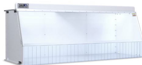
70" Ducted Fume Hood