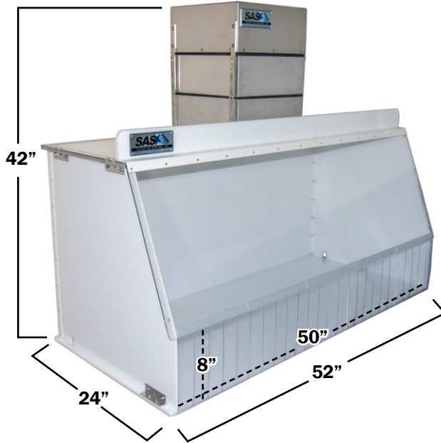
Shown with outer dimensions. Dimensions are approximate.