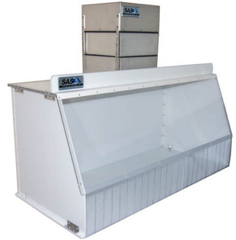
50" High Efficiency Ductless Fume Hood

Please note that the high-efficiency ductless fume hoods are compliant for nonsterile HD compounding only and not for sterile preparations.