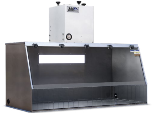
50" Stainless Ductless Fume Hood

Our line of ductless fume hoods is not intended for sterile compounding applications.