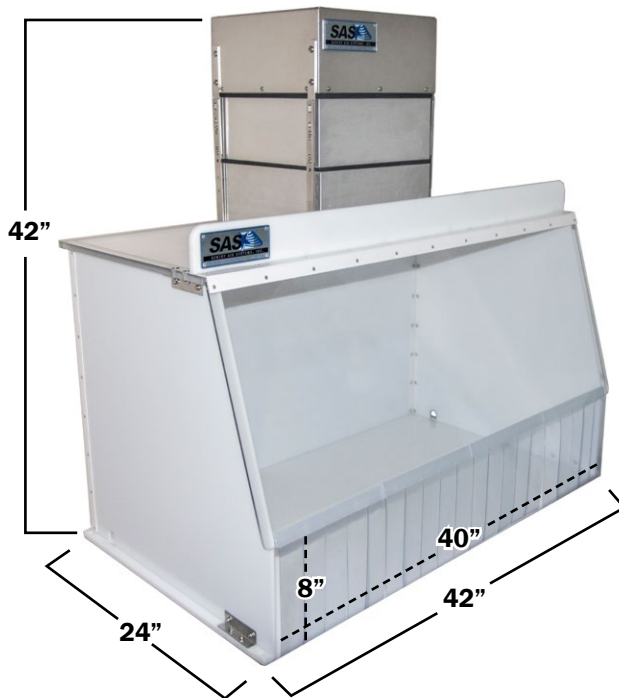
Shown with outer dimensions. Dimensions are approximate.