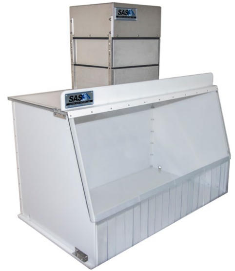
40" High Efficiency Ductless Fume Hood

Please note that the high-efficiency ductless fume hoods are compliant for nonsterile HD compounding only and not for sterile preparations.