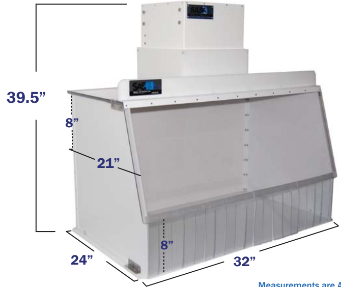
Measurements are Approximate

Limited three-year warranty from date of shipment on defects due to materials or workmanship. PATENT #5,843,197