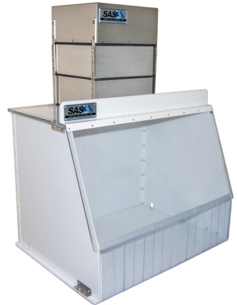
30" High Efficiency Ductless Fume Hood

Please note that the high-efficiency ductless fume hoods are compliant for nonsterile HD compounding only and not for sterile preparations.