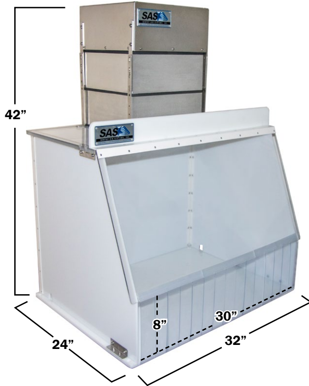
Shown with outer dimensions. Dimensions are approximate.