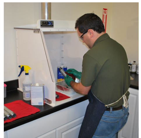
Operator using a 24" Ducted Fume Hood to help remove solvent fumes.