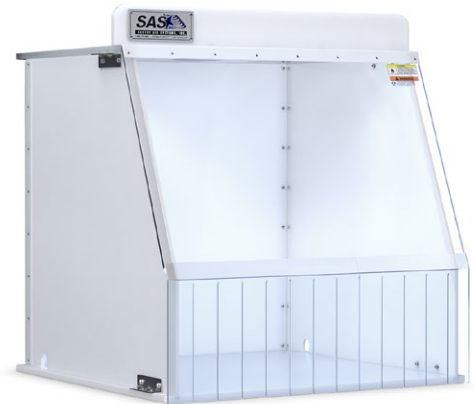
24" Ducted Fume Hood (shown with optional vinyl curtains)