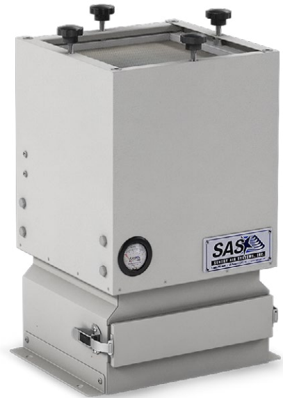
Model 300 Mist Collector