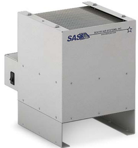
Model 200/225 Smoke Sentry

As a companion to the Smoke Sentry , our line of portable and free-hanging room air cleaners offer added air filtration for indoor spaces.